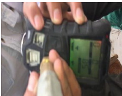
Figure 5: Measurement of methane