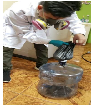
Figure 2: Biodigester load