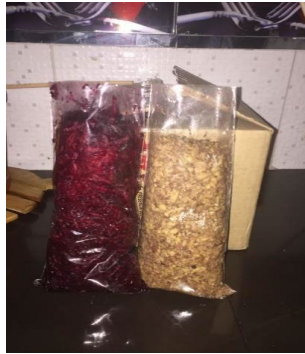
Figure 1: Plant residues added to the inoculum