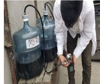
Figure 3: Control of the biodigester