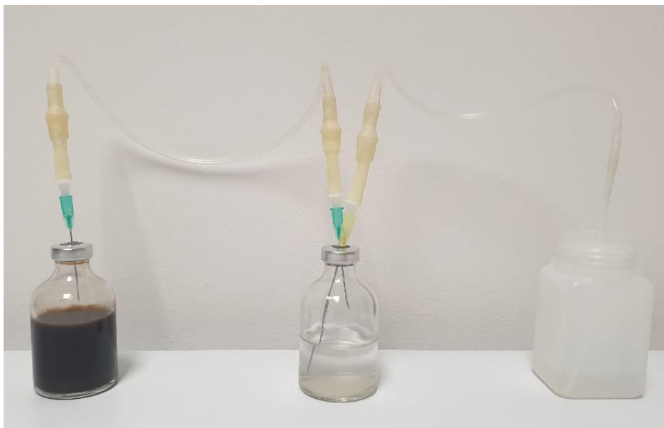
Figure 1: Representation of the experimental system used in this study for the quantification of biogas produced.

In particular, 3 controls and 1 treated sample were set up in the anaerobic bioreactor as described in Table 1. A total of 37.5 g of each mixture was added to the bioreactors considering the percentage of each component specified in Table 1. Analyzes were performed in triplicate.