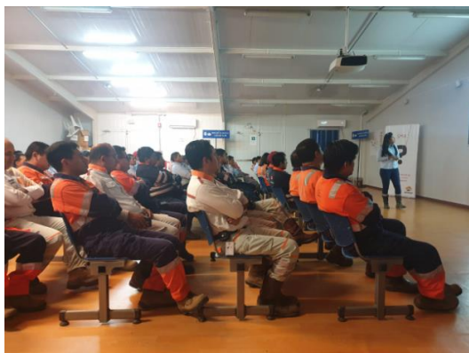
Figure 2: Training for personnel at the Nuevo Mundo operational base camp