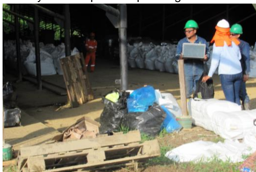
Figure 1: Weighing of waste by solid waste warehouse staff